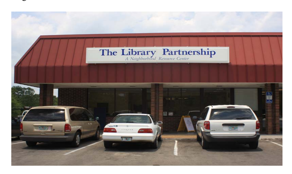
Figure 1. Partnership, a Neighborhood Resource Center.

Two of the LSTA-funded projects fall within the definition of the Collaborative Services Role. The Alachua County Library District (ACLD), the Florida Department for Children and Families (DCF), the Partnership for Strong Families (PSF), the Casey Family Program, and approximately 30 social service agencies work together to create and operate the Library Partnership, a Neighborhood Resource Center . This library provides an example and Figure 1 provides an image of the outlet.